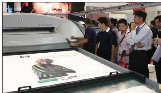
HP Scitex's TJ8500 was unveiled at the Shanghai show.

For more details call Digital Vision today.